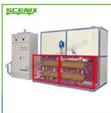
Electrical Heating Oil Heat Furnace