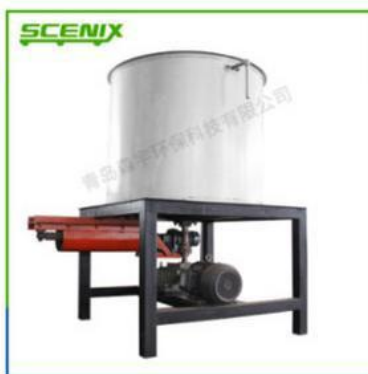
Glue mixing machine